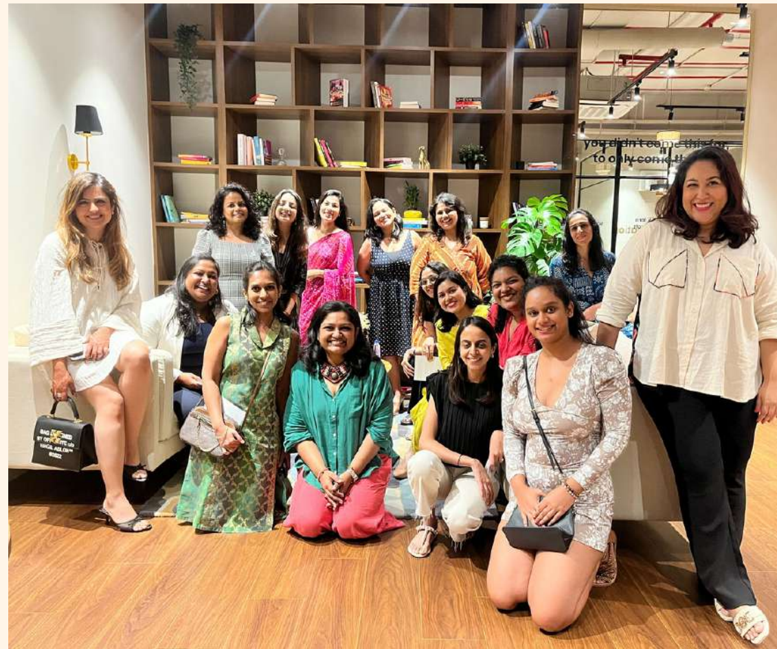
community pecha kucha, karaoke, potlucks, movie nights