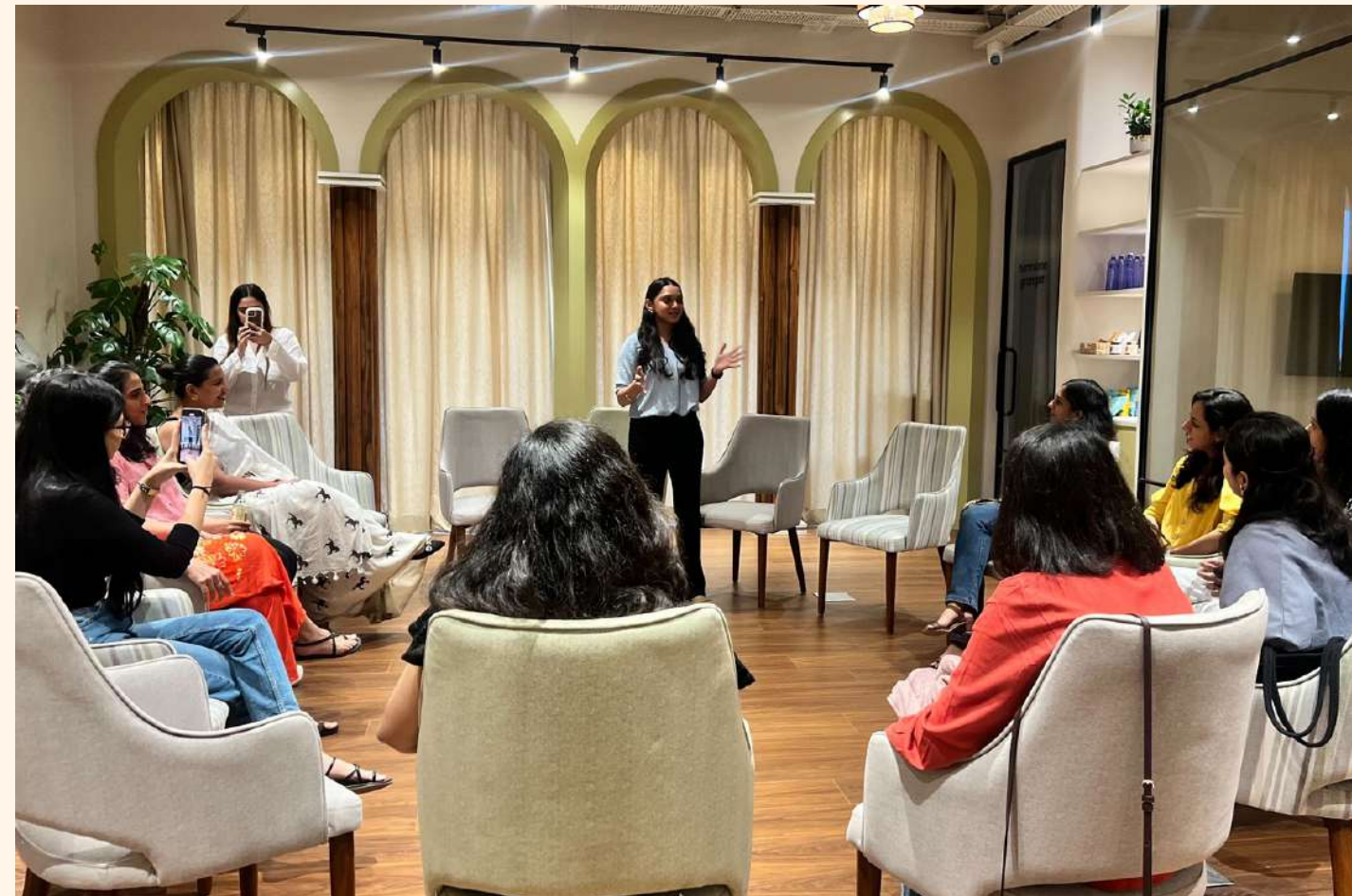
book clubs, founder huddles, marketing brainstorm and more