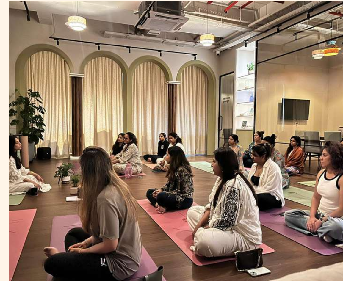
fitness, wellness and everything in between